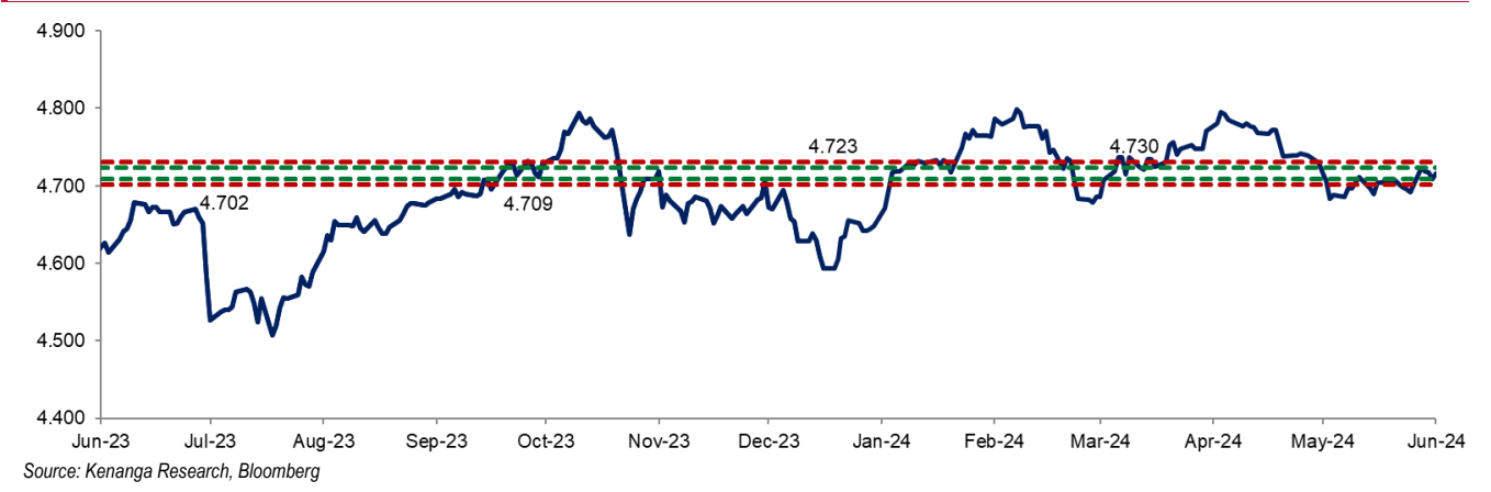
Graph 2: Weekly Performance of Core Pairs