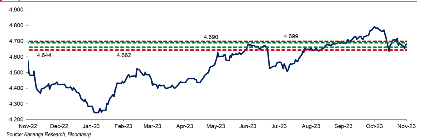
Graph 2: Weekly Performance of Core Pairs